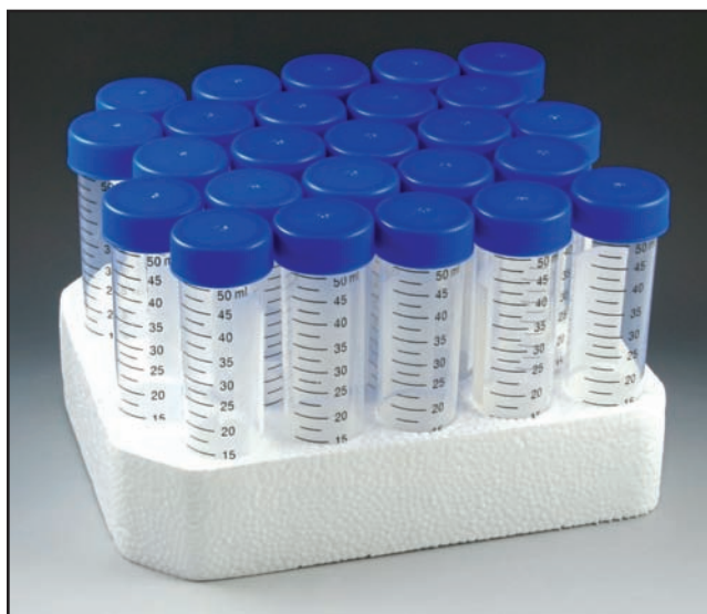
Item# 6289 in 25 place rack